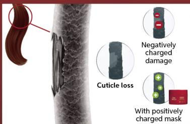
DAMAGE DUE TO HAIR EXTENSIONS